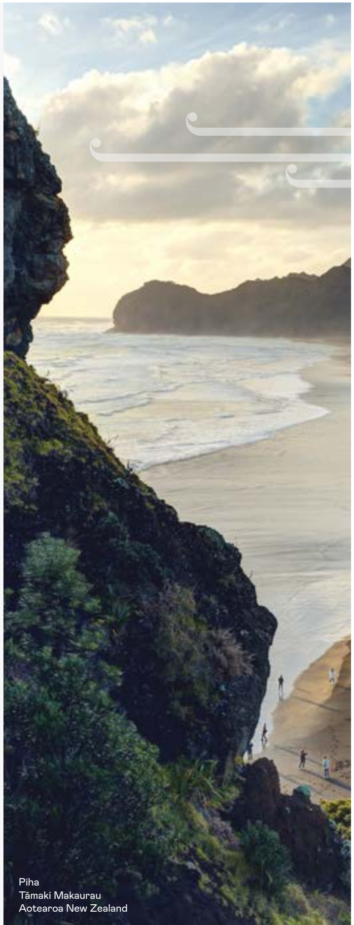
Piha Tāmaki Makaurau Aotearoa New Zealand

*Fidelity Life has an A- (Excellent) financial strength rating from A.M. Best. The rating scale that this rating forms part of is available for inspection at our offices. For more information please visit Fidelity Life's financial strength page .