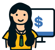
A sole trader.