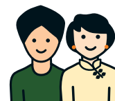
A partner in business.