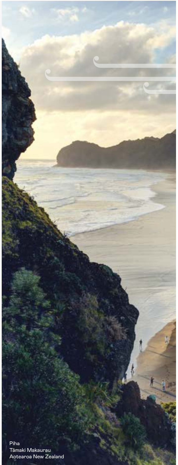
Piha Tāmaki Makaurau Aotearoa New Zealand

*Fidelity Life has an A- (Excellent) financial strength rating from A.M. Best. The rating scale that this rating forms part of is available for inspection at our offices. For more information please visit Fidelity Life's financial strength page .