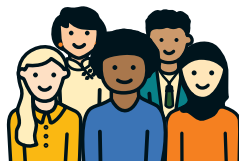
Small business owners.